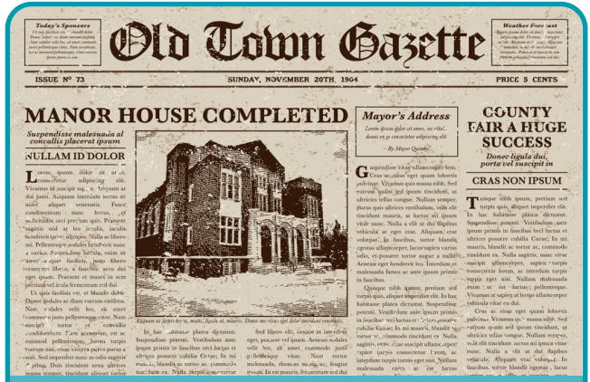
Local newspapers are a valuable source of information on the local area. They reflect the period in which they were written and provide details about local people and significant events.